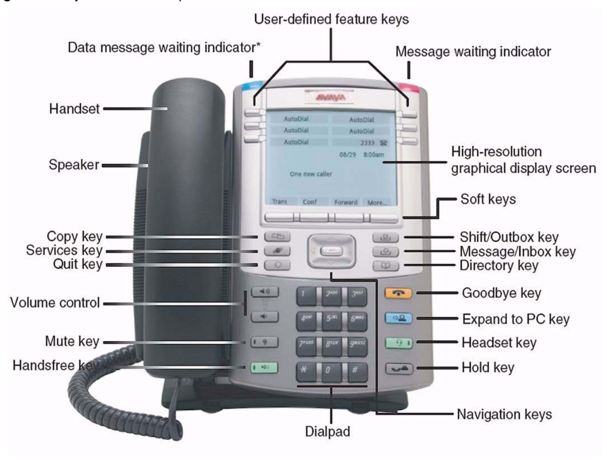
Figure 1 Avaya 1140E IP Deskphone

Figure 1 shows the Avaya 1140E IP Deskphone.